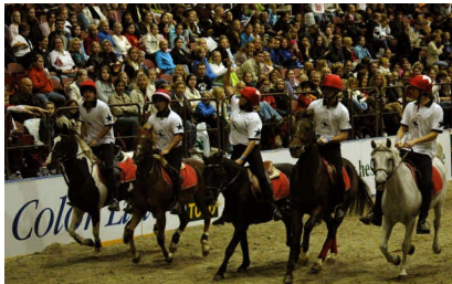
OSLO HORSESHOW 2004

The games has been involved with the Gothenburg horseshow for many years but has only recently began its relationship with the Oslo Horseshow held in the beautiful spectrum arena in the heart of Norway's capital!